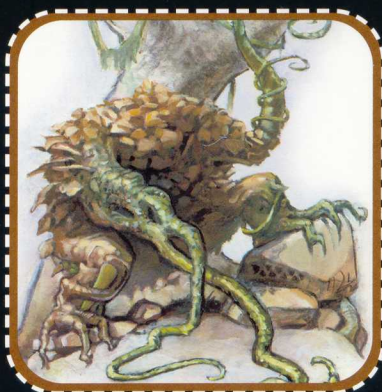
Huge Shambling Mound