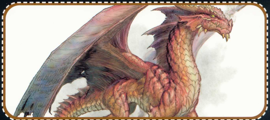
Huge Red Dragon